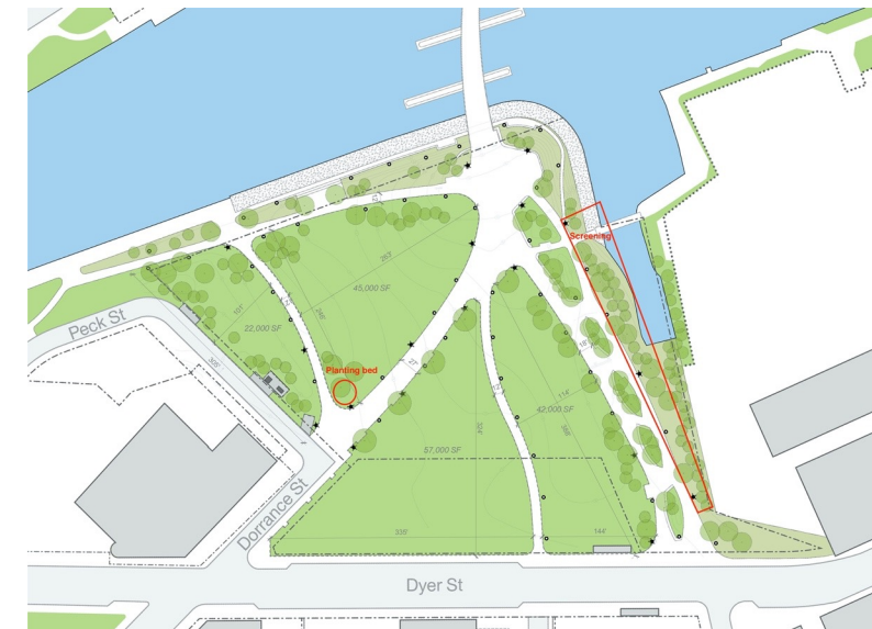
PROVIDENCE WATERFRONT PARK - WEST SIDE