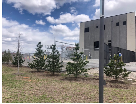
Issue: Lawns on east side with no irrigation