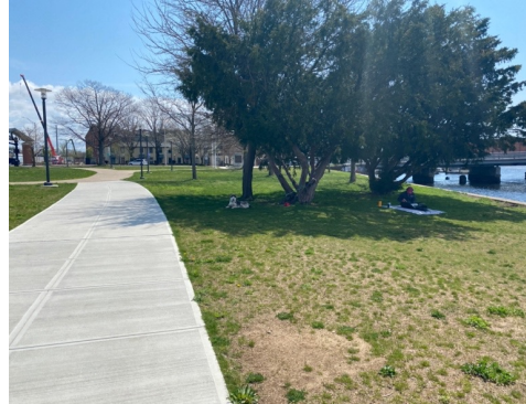
Issue: Lawns on east side with no irrigation